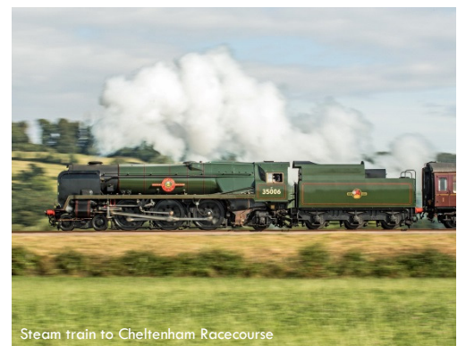
Steam train to Cheltenham Racecourse