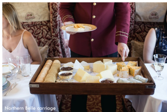
Northern Belle carriage