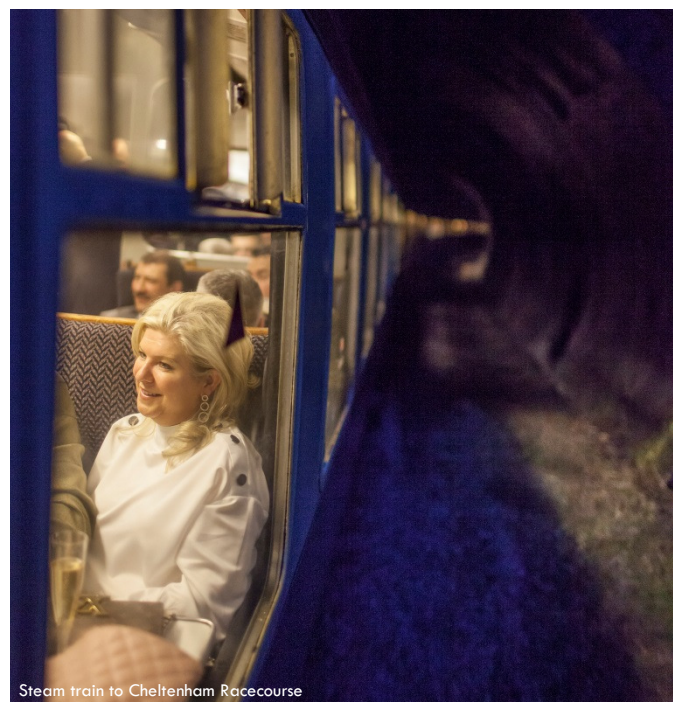
Steam train to Cheltenham Racecourse