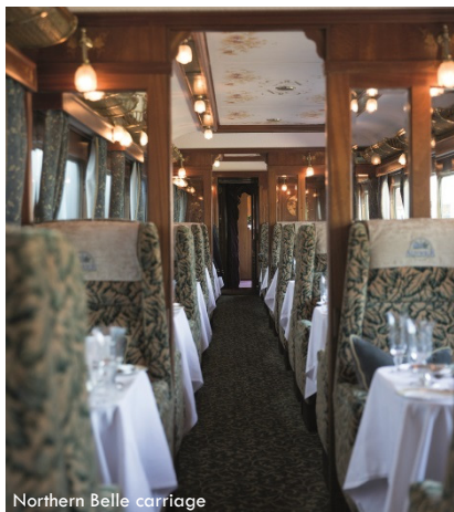
Northern Belle carriage

PLEASE NOTE: ALL TICKETS WILL BE DISPATCHED 7 DAYS PRIOR TO THE EVENT