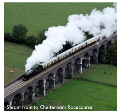
Steam train to Cheltenham Racecourse