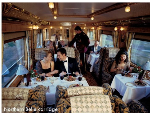
Northern Belle carriage