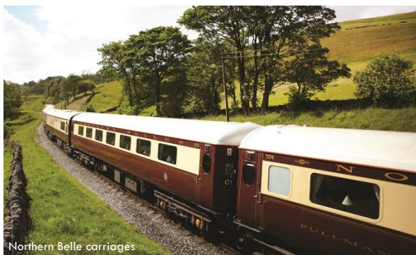
Northern Belle carriages

Friday 15th March 19 (Gold Cup Day): £525.00 per person (VAT does not apply)